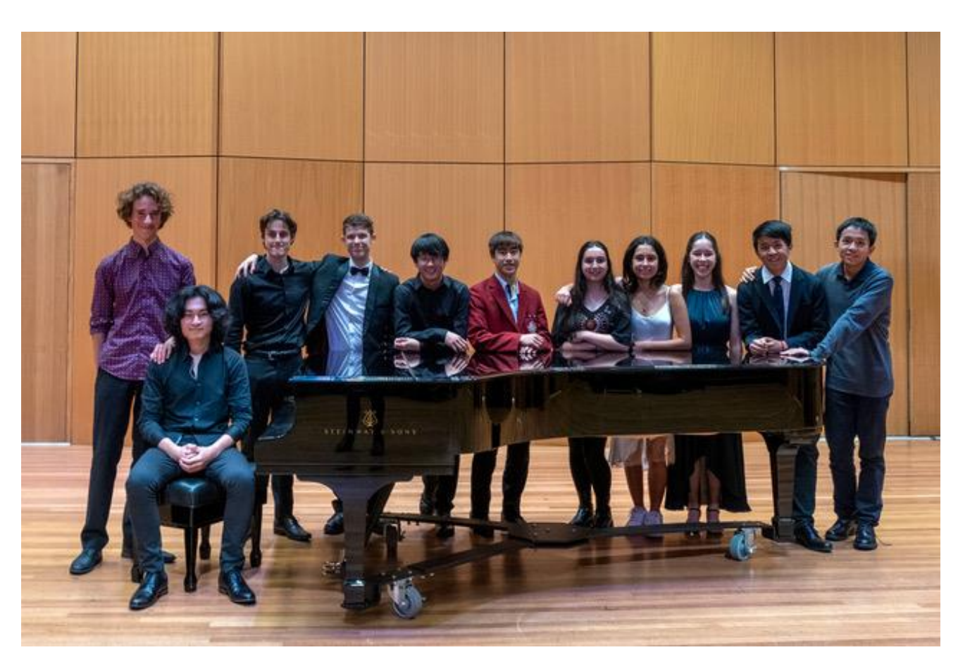
Regional Finalists 2023