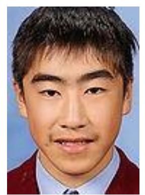
Max Gear Cello